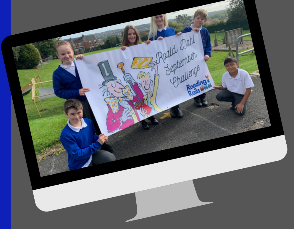
All year groups have the opportunity to take part in half termly reading competitions to boost engagement in reading. As each term is themed, this allows the children to develop a real breadth in reading, exposing them to authors and genres which they previously may not have considered.

To support our reading journey, all of our Reading Rails books are leveled and pupils are guided to make a choice that is both enjoyable and suitably challenging. This is done through the use of Accelerated Reader and STAR reader from Renaissance Learning. Through taking quizes on the books they have read, and STAR reading tests at the end of each half term, they can see their progress as their reading age increases and their book choices grow.