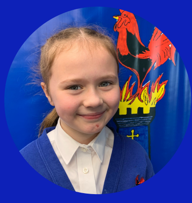
"You can see how much you have read by looking at your word count it makes you want to read more!"