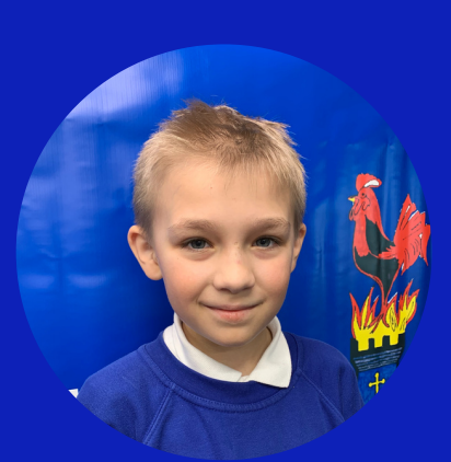
"The more you read, the more you learn!"

This all builds towards a very positive reading environment, but don't take our word for it - hear it directly from our own pupils by scanning the code to the left.