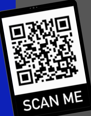
Independent reading runs hand in hand with whole class and guided reading across the school, with carefully selected whole class texts being red half termly, selected to broaden cultural understanding, and linked to the overarching topic of the half term.

This all builds towards a very positive reading environment, but don't take our word for it - hear it directly from our own pupils by scanning the code to the left.