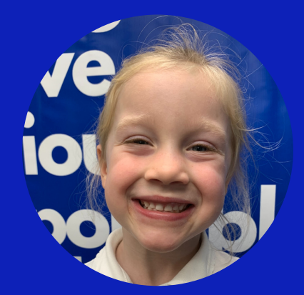
"I love to read and choose my own books - it's great fun!"