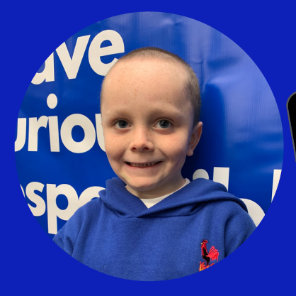
"I didn't know how many different kids of books there were!"

To support our reading journey, all of our Reading Rails books are leveled and pupils are guided to make a choice that is both enjoyable and suitably challenging. This is done through the use of Accelerated Reader and STAR reader from Renaissance Learning. Through taking quizes on the books they have read, and STAR reading tests at the end of each half term, they can see their progress as their reading age increases and their book choices grow.