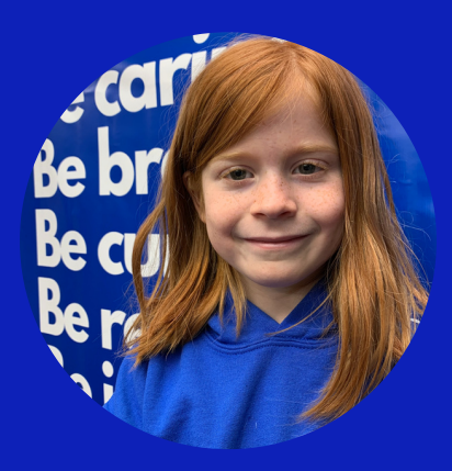
"Reading is good for your brain and it helps you to write - I love it!"