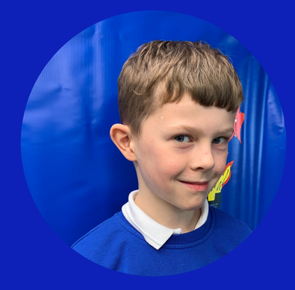
"The challenges help me to read different kinds of books."