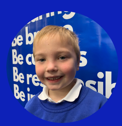
"Collecting the stickers is great!"